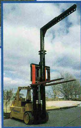
Direct lift, no chains